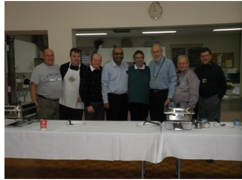
St. Paul's Parish breakfast on November 23 rd . Pictured above and below are the servers.