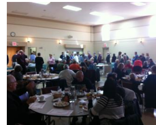
Parishioners enjoying breakfast