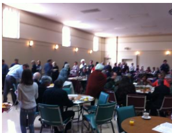
Parishioners enjoying breakfast