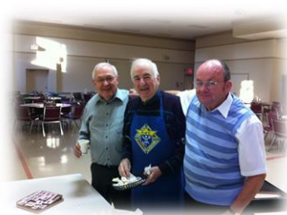
Three more of the Knights working