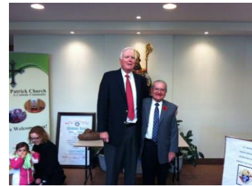
Two of our Knights working at the breakfast