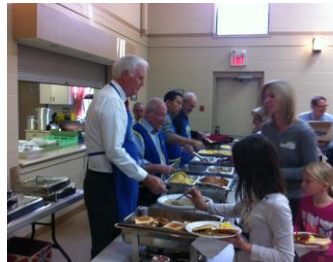
Knights serving St. Patrick's parishioners